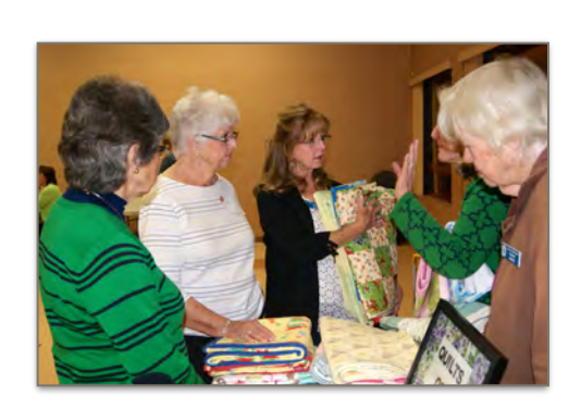
Quilts of Lovin' the green