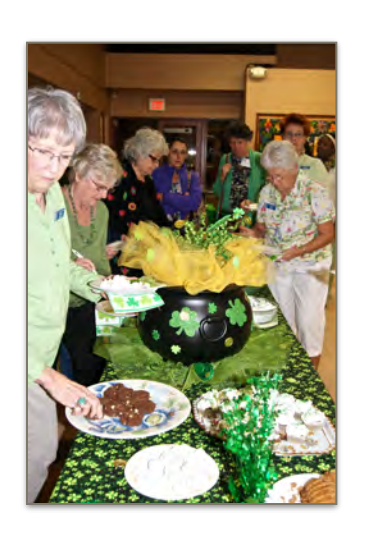
The eatin' of the green and we ate more than just salad!!!!!!