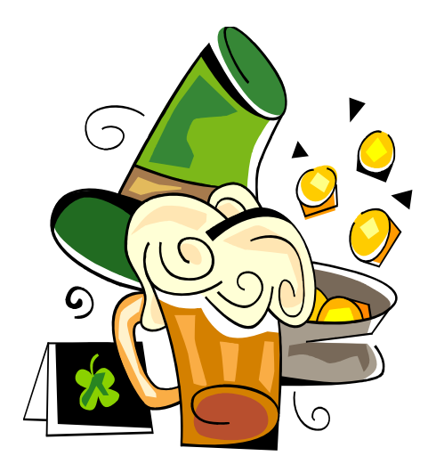
HAPPY ST. PATRICK'S DAY

Next Meeting: Thur., Mar. 7 at 6:30pm at the Fallbrook Community Center. Corner of Fallbrook Street and Heald.