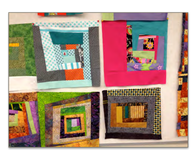
Grab some scraps, sew and voila!