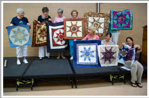
Ladies from Feathered Star September workshop

We had a wonderful back to school experience at our September meeting. If you missed it, here are some photos of some of the stations and students. I think everyone should receive good grades for demonstrating and attending.