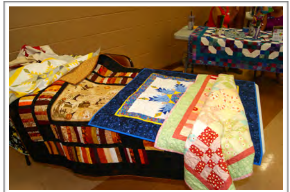
Always a plethora a beautiful sharing quilts!