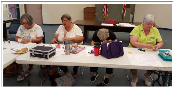
Some people really don't like having their photos taken