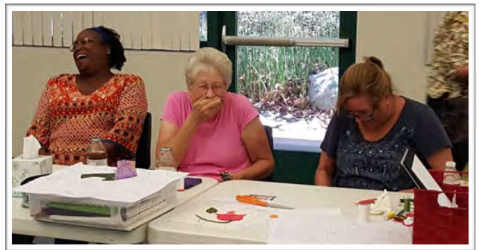
We all want to know what is going on here!