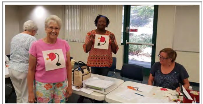
And others love displaying their work front and center!